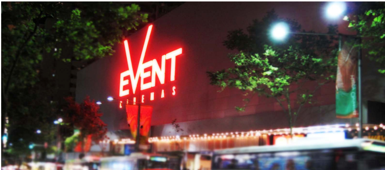
EVENT CINEMAS, GEORGE ST., SYDNEY

Indonesian Film Festival Melbourne, 20-26 Aug 2010 | Sydney, 26 – 29 August 2010